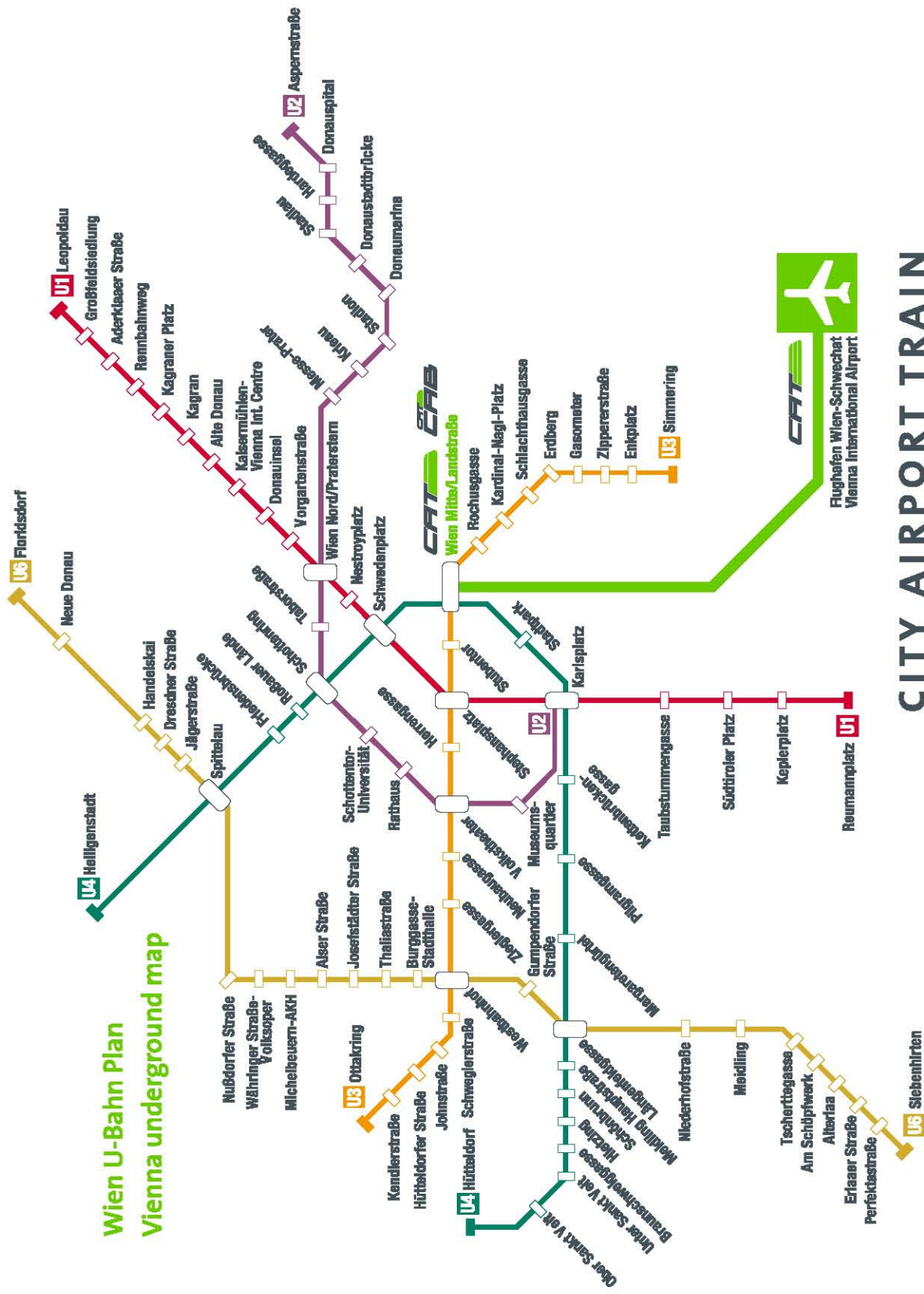
Wien U-Bahn Plan Vienna underground map